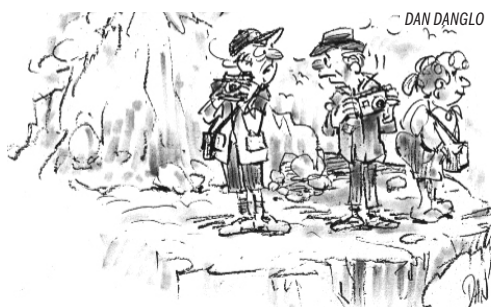
WHAT'S YOUR PROBLEM BUDDY, PIXEL ENVY?

When setting type, most of us are very conscious of type style, size, width and line spacing. Many of us also pay attention to letter spacing and kerning, even if we're not as confident in these areas. But word spacing – the space between words – is probably the most neglected of typographic attributes. This seemingly small detail plays an important role in the color, texture and readability of your type. ↗